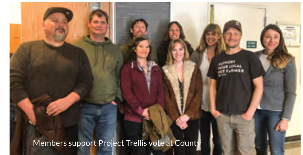
Members support Project Trellis vote at County

Advocacy comes in many forms: coalition building, thousands of phone calls, texts & emails, panel engagement, and stakeholder presentations